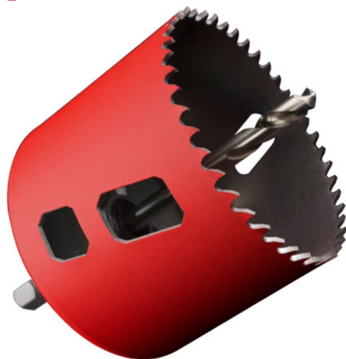
Combined with an innovative side slot shape, the M.K. Morse tooth design offers easy slug removal.

Typically, bimetal holesaws are made by welding a tool steel edge wire to a low-alloy steel, which serves as a backer. However, when the cutting edge wire is improperly welded to the steel backer, it can cause the holesaw to fail. In fact,