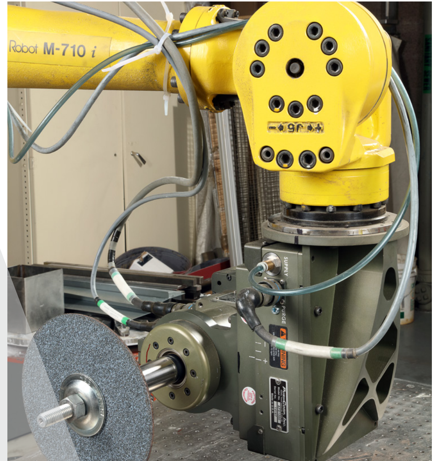
A force control device from PushCorp Inc. with a Scotch-Brite Unitized Wheel for deburring on a turbine blade.

At its most basic function, a robot is designed simply to reach a point in space. At 3M →